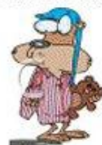
HOME IN PJ'S